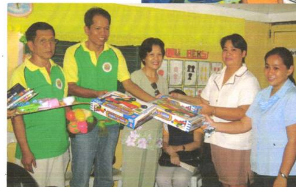
Brgy Basak Officials and the Day Care Center Teachers gladly accepts the new teaching aides and play house tools & toys