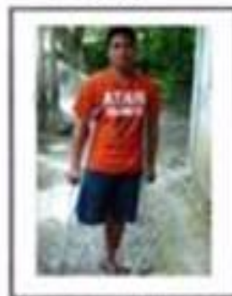
Name: ... Address: ... Age: ... Disability: ...