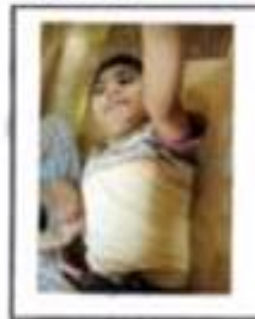
Name: ... Address: ... Age: ... Disability: ...