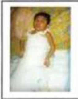
Name: ... Address: ... Age: ... Disability: ...