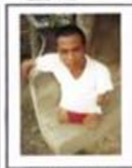
Name: ... Address: ... Age: ... Disability: ...