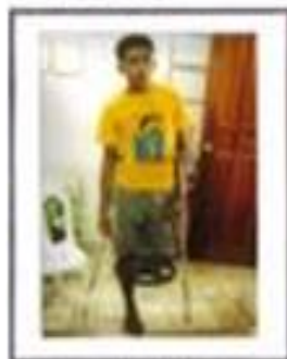
Name: ... Address: ... Age: ... Disability: ...