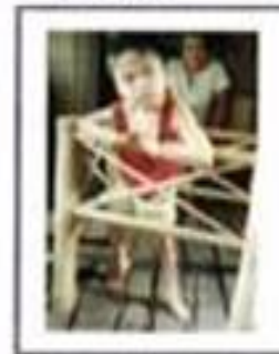
Name: ... Address: ... Age: ... Disability: ...