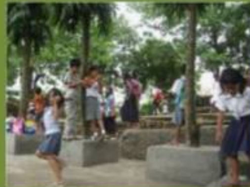
Vegetable Gardening at Bagong Lipunan Elem School.