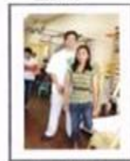
Name: ... Address: ... Age: ... Disability: ...