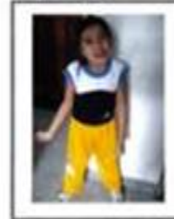
Name: ... Address: ... Age: ... Disability: ...