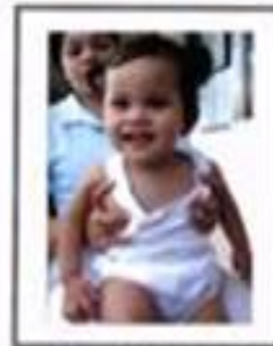
Name: ... Address: ... Age: ... Disability: ...