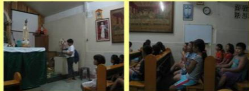
Summer Values Seminar Bgy Lorega San Miguel