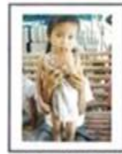
Name: ... Address: ... Age: ... Disability: ...