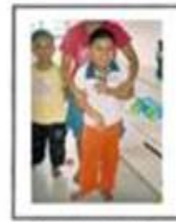
Name: ... Address: ... Age: ... Disability: ...